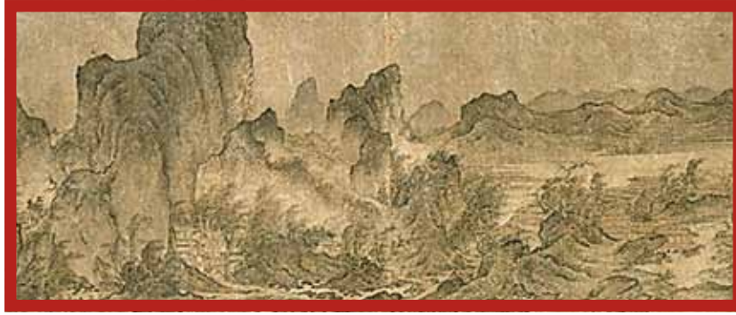
Yan Wengui, Landscape with Pavilions , 10th century, Osaka City Museum of Fine Arts.