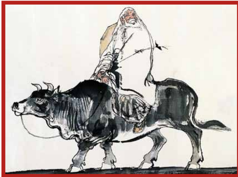
Portrait of the Philosopher and poet Laozi (also Lao-Tzu or Lao-tze) 5th or 4th century BC.