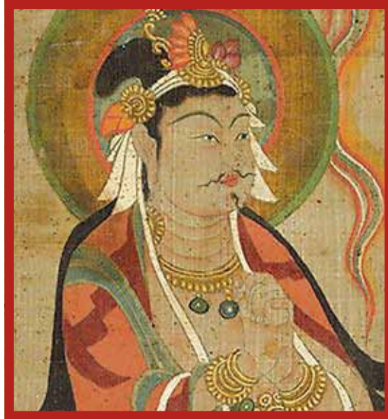
Unidentified Artist, Bodhisattva Wearing Monastic Robes, 9th century, Musée Guimet, Paris, France

A Certificate delivered by the Fudan University, School of Philosophy certifies attendance in the 9 weekends of courses in this program.